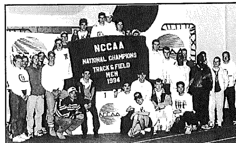
Men's Track & Field Champions Indiana Wesleyan University

Cedarville College Cedarville, Ohio May 6-7, 1994